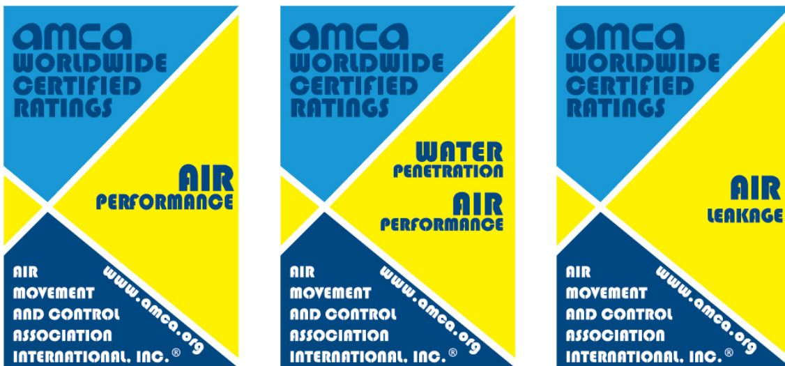
Figure 1. CRP seals for air performance (pressure drop), water penetration/air performance, air leakage.

“When reviewing a louver’s submittal sheet, how can we be sure that the performance stated on the sheet is accurate?”