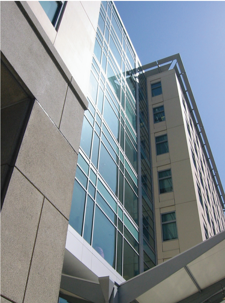
Kaiser Geary Medical Office Building uses thermally powered VAV diffusers.

Doctors and nurses offices are located along the building perimeter and architectural interior light shelves provide indirect natural light for the perimeter spaces.